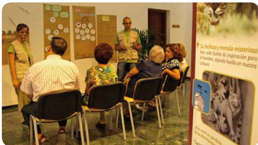
Volunteers carrying out promotion activities in the Villafranca de Córdoba municipality.

On September 19, the last Life Lynx volunteer programme came to an end in the Sierra Morena as part of the awareness activities for the Life Project organised by Ecologistas en Acción - Andalucía, in collaboration with the Ministry for the Environment of the Autonomous Government of Andalusia and Villafranca de Córdoba town hall.